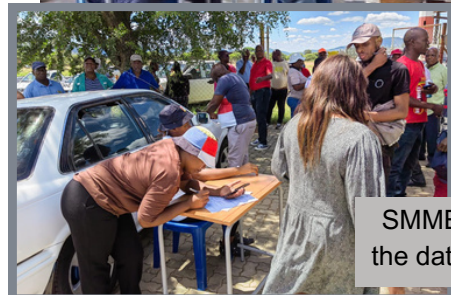
SMMEs who attended got an opportunity to fill the data-base forms before the briefing session.