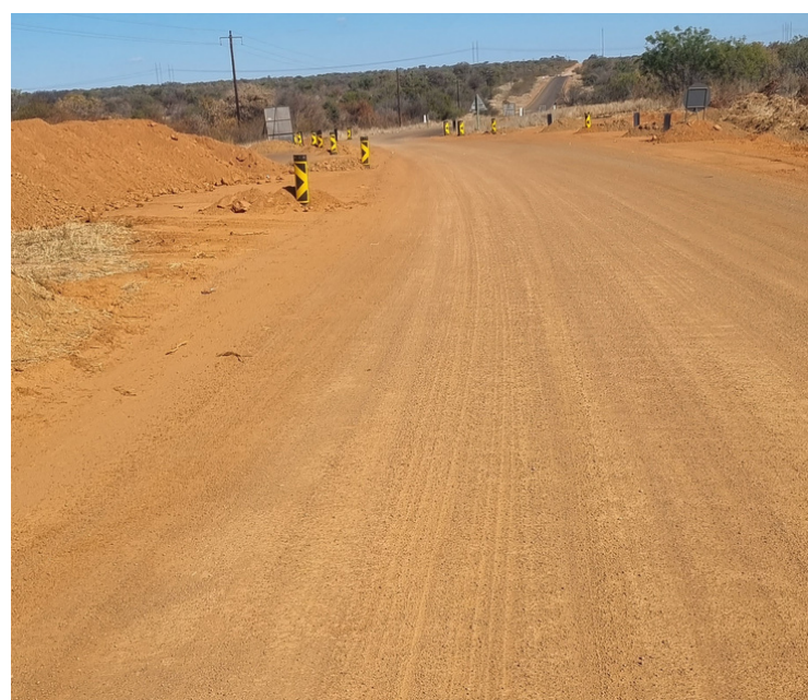
Photo: Road work